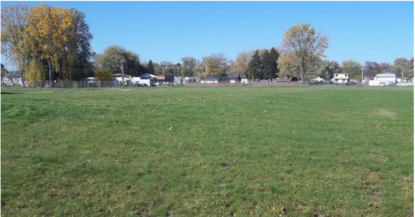
FlightTurf® at Erie International Airport (ERI)

FlightTurf® is a patented proprietary mix and method of maintaining airfields. It meets the Federal Aviation Administration (FAA) seeding specification, Part 139 requirements, FAA Advisory Circulars, USDA recommended wildlife control, and industry standard best practices.