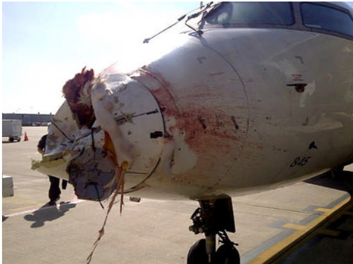
Atlanta Southeast (Delta) bird strike, April 1, 2011

According to the Inspector General's report to the FAA, "In the past 2 decades, wildlife strikes have steadily and dramatically increased, from 1,770 reported in 1990 to 9,840 reported in 2011, a five-fold increase. Wildlife strikes have resulted in at least 24 deaths and 235 injuries in the United States, and since 1988, 229 deaths worldwide. They also have caused nearly 600,000 hours of aircraft downtime and $625 million in damages annually." While the FAA has quoted similar statistics 1 , the bottom line is the same – human lives are being risked unnecessarily while millions of dollars are being squandered. Taxpayers should not be burdened with this cost.