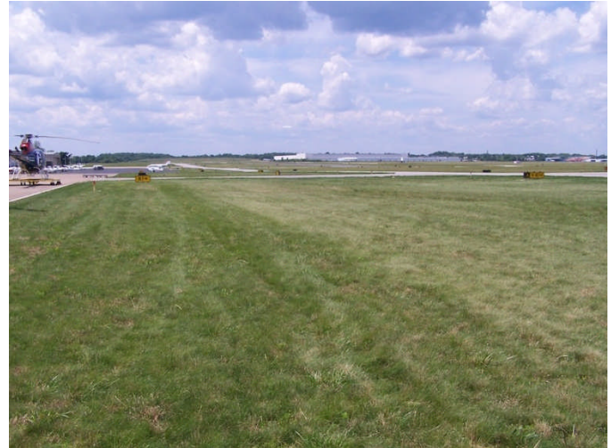
FlightTurf®, by contrast, is weed-free and requires little mowing. Plot pictured above is 20 months old