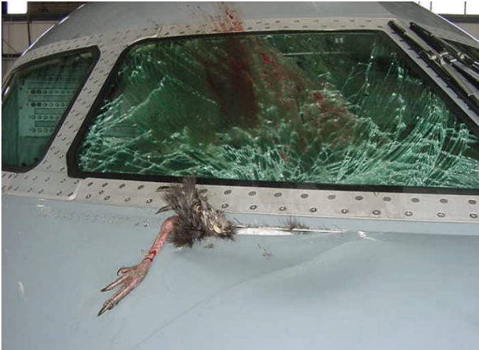
Bird strike on commercial aircraft, March 9, 2002