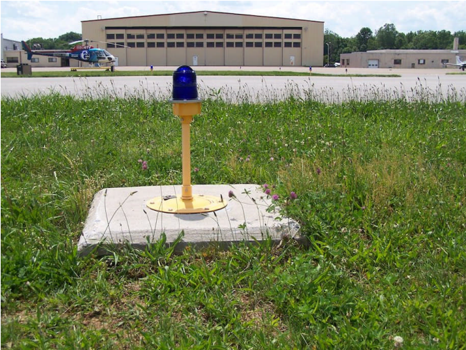
Runway safety areas are weedy and difficult to mow