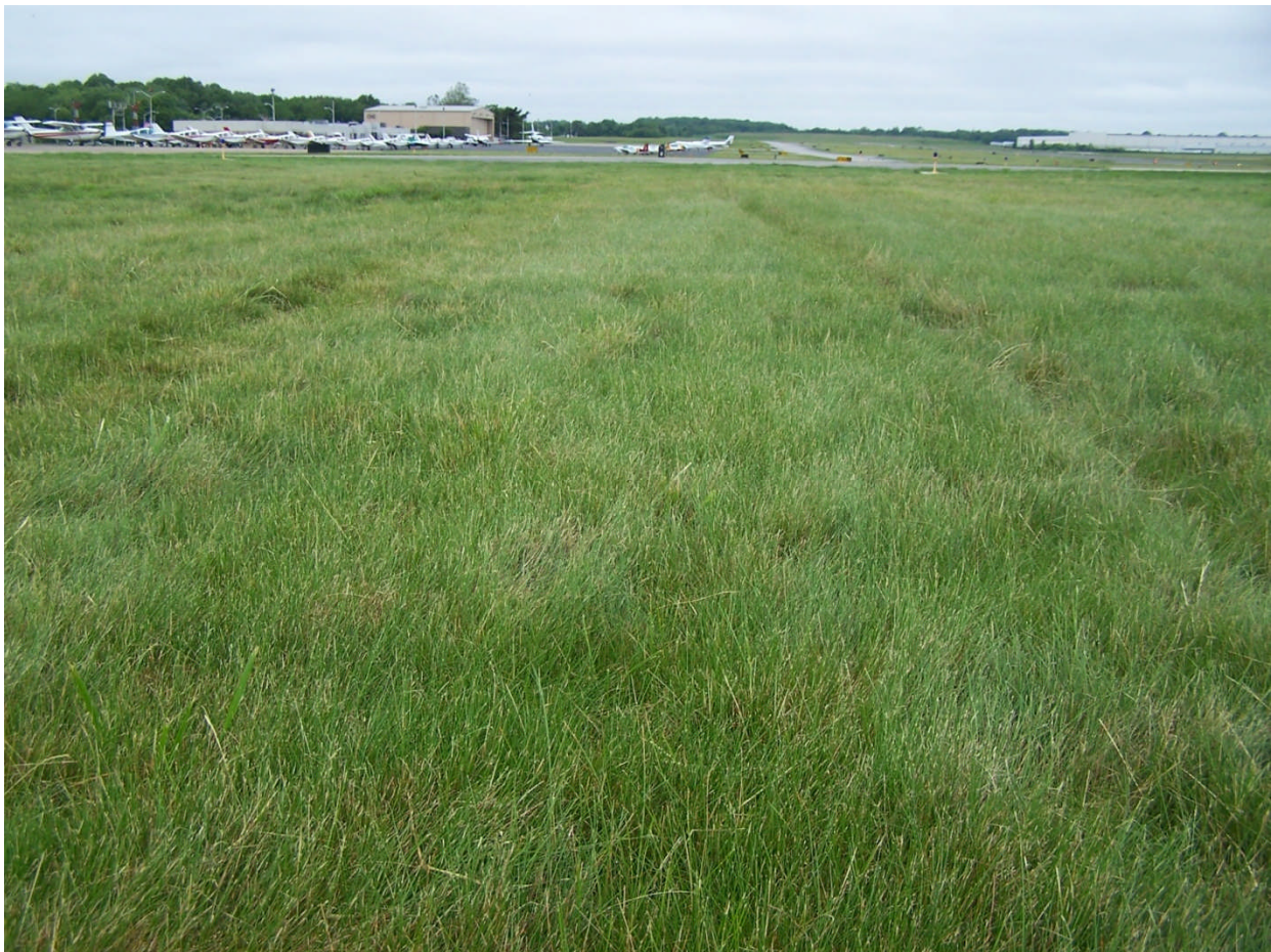
FlightTurf® at Northeast Philadelphia Airport (PNE)

Turfgrass Technology Developed to Increase Safety and Efficiency on Airfields