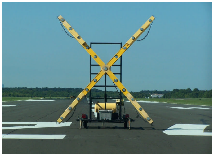
Runway closed for mowing