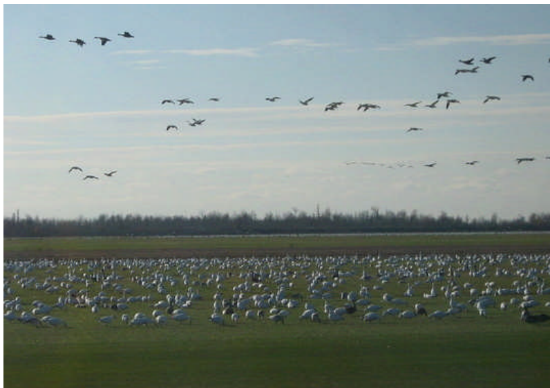
Flocking geese are common on airfields in the USA

Yet, as previously explained, in light of depleting natural resources and the attraction of wildlife to the food source within open airfields, standard turfgrass practices must progress. The best solution is often the most logical. In this case, in line with Dr. DeFusco’s thinking, it is clear that standard turfgrass and its maintenance is the source of the problem. Therefore, the most logical solution is to plant an alternative vegetative cover. The optimal vegetative cover would achieve two goals: one, it would offer cost savings, and two, it would deter wildlife.