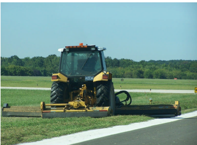
Heavy mowing equipment causes runway incursion

The use of heavy equipment in runway safety areas presents a significant safety risk. Airports experience difficulties maintaining operational capacity when shutting down runways to mow airfields. Both airport profitability and safety are significantly impaired.