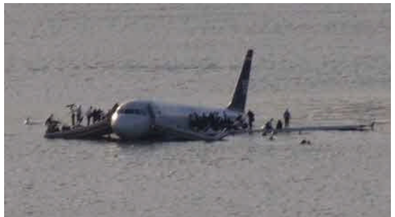
US Airways Flight 1549, bird strike crash into Hudson River, Jan. 15, 2009

An underlying cause of wildlife strikes is the standard turfgrass employed by most airports. Wildlife are attracted to the grass as well as other food sources on airfields. Animals flock and gather on and around airfields, impeding the flights of airplanes, endangering lives, and damaging aircraft.