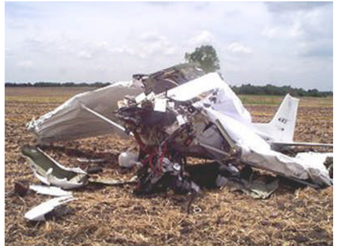
Fatal crash, Addison, TX, July 8, 2003